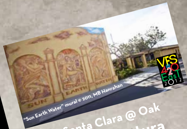
420 E. Santa Clara @ Oak Downtown Ventura